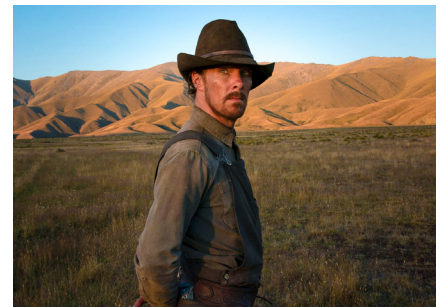
The Power of the Dog

House of Gucci (15, 2h37m) Ridley Scott's darkly entertaining, star-studded true story of glamour, desire and ultimately murder among the aristocracy of the fashion world.