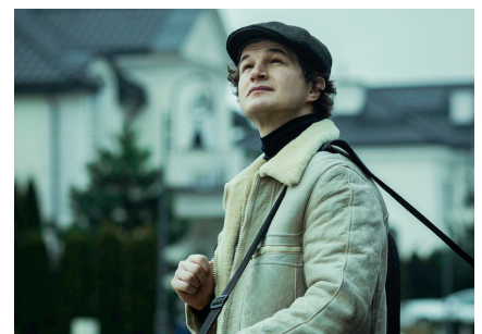
Never Gonna Snow Again