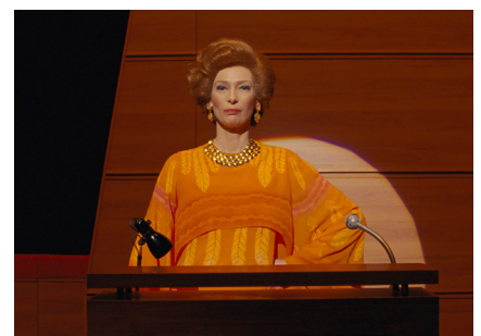
The French Dispatch