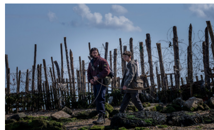
28 Years Later

In this terrifying zombie thriller, a group of survivors venture beyond the safety of their island into the dark heartland of the infected.