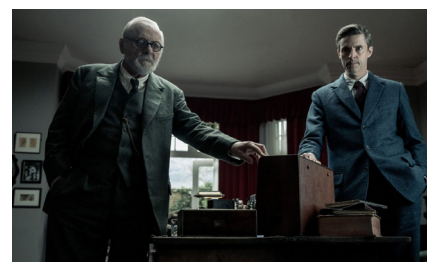
Freud's Last Session

Anthony Hopkins and Matthew Goode star in this introspective drama adapted from Mark St. German's acclaimed stage play.