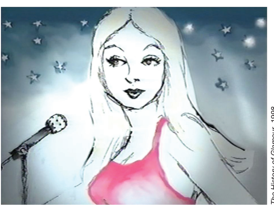
The History of Glamour, 1998