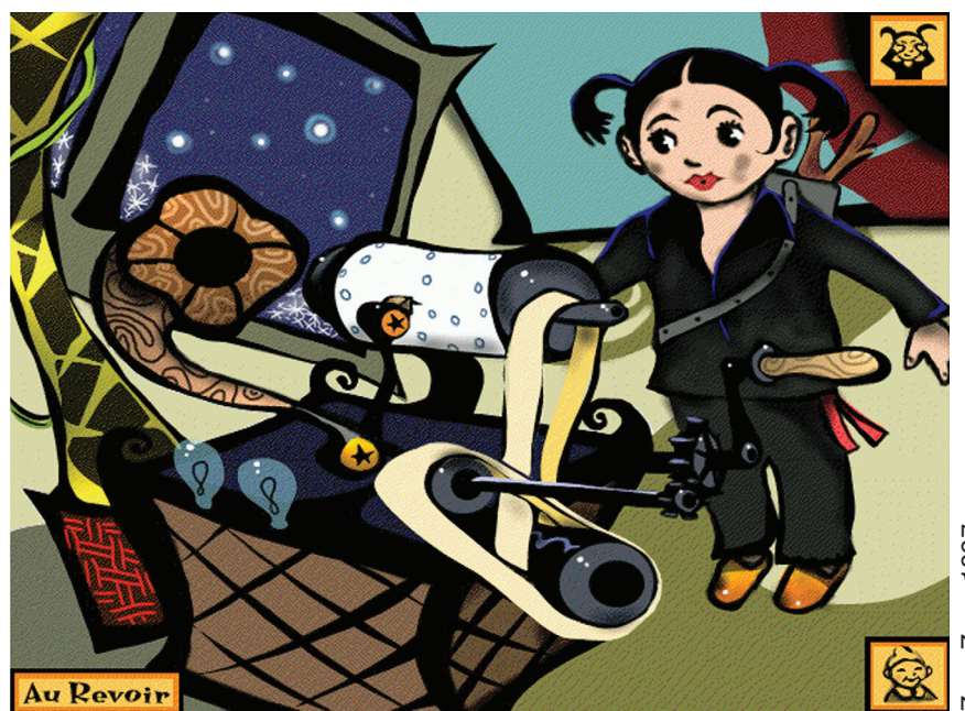
Zero Zero, 1997