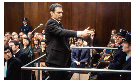
The Goldman Case

This biographical docudrama focuses on the trial of far-left activist Pierre Goldman, who was accused of four murders in 1975.