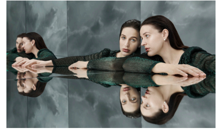
Tristan und Isolde

The electrifying Lise Davidsen tackles one of the ultimate roles for dramatic soprano: the Irish princess Isolde in Wagner's transcendent meditation on love and death. Heroic tenor Michael Spyres stars opposite Davidsen as the love-drunk Tristan. This is the advent of a new, Met-debut staging by Yuval Sharon.