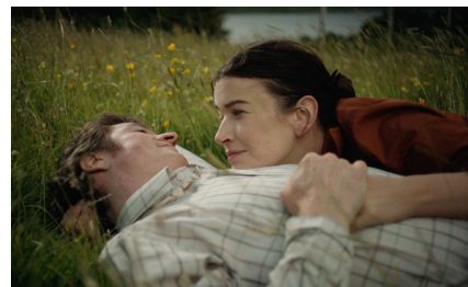
That They May Face the Rising Sun

This beautifully realised adaption of John McGahern's last novel captures a year in the life of a rural community in 70s Ireland.