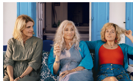
Two Tickets to Greece

Take a trip to the sundrenched Greek Islands in this breezy French comedy which celebrates female camaraderie and friendship.