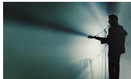
A Complete Unknown