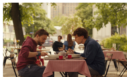
A Real Pain

Two polar opposite cousins reunite for a tour through Poland to honour their grandmother - but old tensions soon resurface.