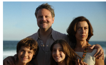
I'm Still Here

Winner of the Best International Feature Film at the Academy Awards, this Brazilian drama explores family life under an oppressive regime.