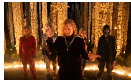
28 Years Later: The Bone Temple

Nia DaCosta directs a spine-chilling continuation of the 28 Years Later saga, which sees Ralph Fiennes reprise his role of Dr. Kelson.