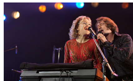
Song Sung Blue

Based on a true story, two down-on-their-luck musicians (Hugh Jackman and Kate Hudson) form a joyous Neil Diamond tribute band.