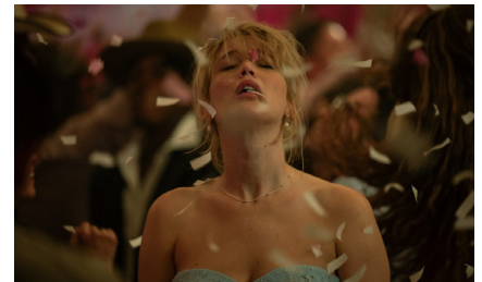
Die My Love

A mother (Jennifer Lawrence) unravels mentally, leaving a path of destruction in her wake, in Lynne Ramsay's eagerly-awaited film.